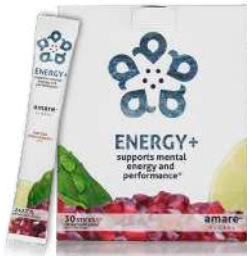
Energy+ YOUR "ON" SWITCH

FUEL YOUR MENTAL EDGE WITH ALL-NATURAL PRODUCTS!